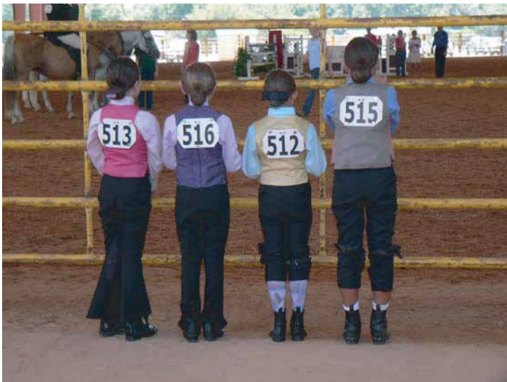
Academy kids ready to go